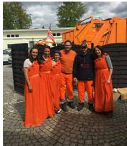
Thrift Shop Prom Event