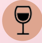
WINE TASTING CLUB