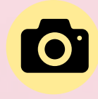
OH SNAP! PHOTOGRAPHY