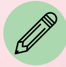
DO IT, WRITE