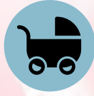
MOM & TOTS