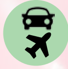
WHO KNEW! TRAVEL TALK